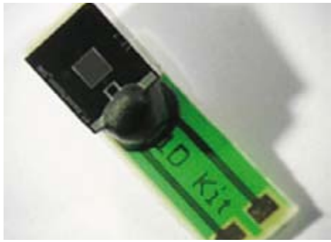
Chip on 3mm x 10mm standard PCB board (including magnets)