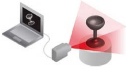
3 D Scanning System