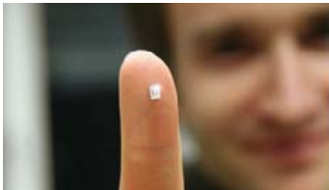
MEMS Mirror Chip Actual Size

Resonant actuation: specifically designed MEMS mirrors to be actuated at their mechanical resonant frequency. The maximum intrinsic silicon material gain is used to obtain the widest possible scanning angle at an ultra-low power consumption level.